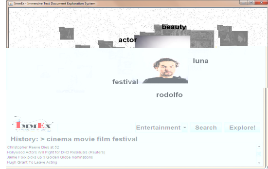
Figure 1. ImmEx exploration system: the visualized image, when clicked, allows the user to easily specialize her exploration by focusing on concepts like actor, or beauty, in the “Entertainment” context.

In Figure 1 we show the interface of the proposed system: at the beginning of the exploration process, the user