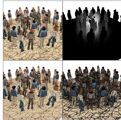
Figure 2: Texture level of abstraction using dynamic perception based strategy